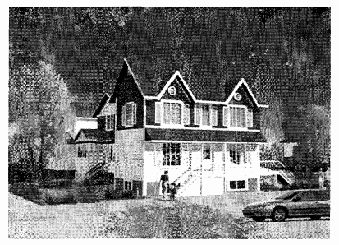
An infill affordable home in Regina, Saskatchewan, Canada