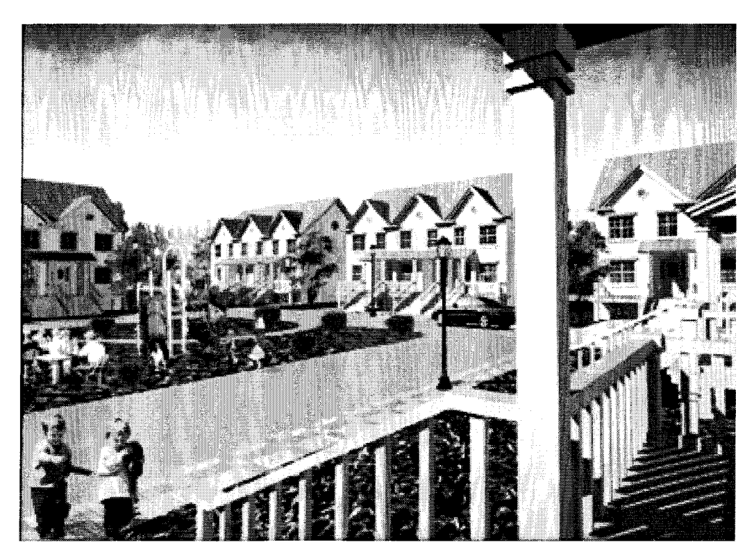
A community with affordable dwellings in Regina. Saskatchewan. Canada